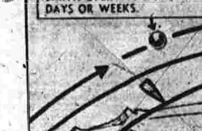
Diagram shows how the world's first artificial earth satellite will be shot aloft by rocket from the U.S. territory sometime between July 1957 and December 1958, according to a White House announcement today.

FINALLY SUCCEEDING TO GRAVITY, SATELLITE GLIDES INTO A SPHERE AND IS DESTROYED